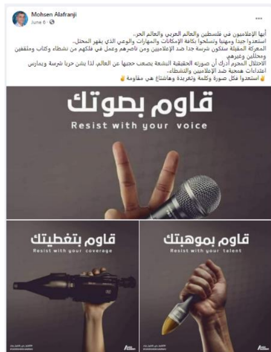
Al-Ifranji's post in favour of using traditional and new media against the enemy