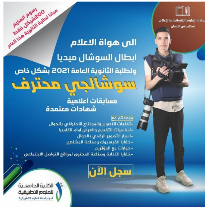
A university college banner addressing high school students and urging them to enroll into a communications and propaganda course

example, it announced on July 29 th , 2021 in its Facebook account that it would provide a special communications course: “to the lovers of communications, heroes of social media and particularly 2021 high school students: a social media professional”, for 200 ILS. 24 It should be noted, Hamas’ leadership makes it a priority to maintain contacts with the students (e.g. in July 2016 Ismail Haniyyeh attended a graduation ceremony). 25