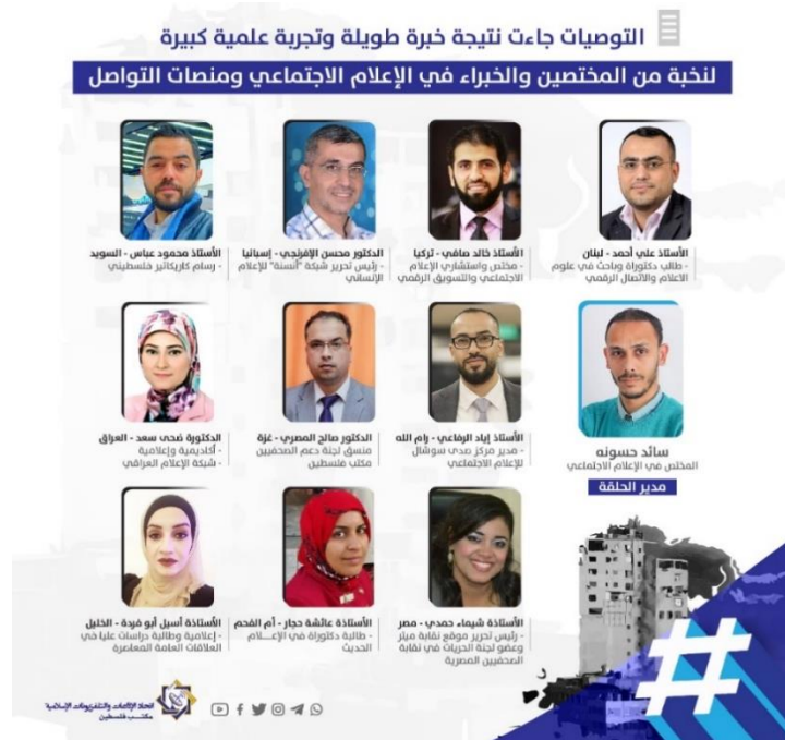
An IRTVU Palestine banner on improving propaganda vs. Israel following Operation Guardian of the Walls