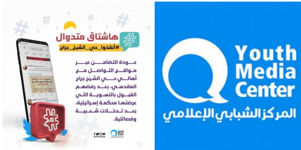
Right to left: the center’s logos; an online campaign under the hashtag “save Sheikh Jarah neighborhood”

February 2021 the center granted an award to some 50 young Palestinians (makes and females) for their propaganda activity on social media during 2020. 33