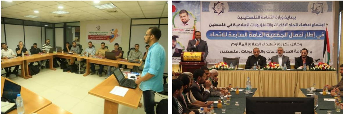
Right to left: IRTVU inauguration ceremony, April 2014; A training course given by IRTVU Palestine on social media propaganda, September 2019

Since Operation Guardian of the Walls IRTVU Palestine conducted several online discussions on improving the Palestinian propaganda vs. Israel on social media. On June 8 th , 2021 it held an online conference titled “The Role of Social Media During the Aggression in Gaza” and stressed its contribution to promoting the Palestinian narrative and challenging the IDF. Among the insights and recommendations offered in this conference: